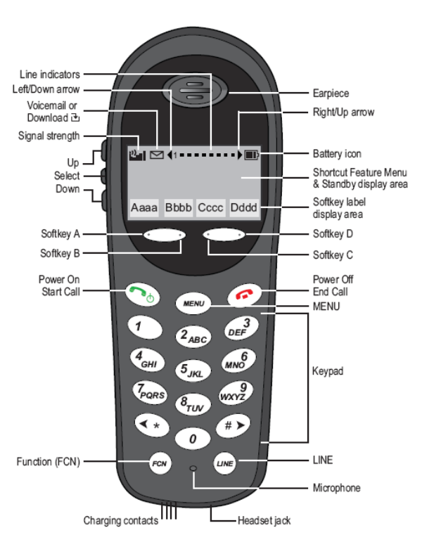
SpectraLink 8002 Wireless Telephone